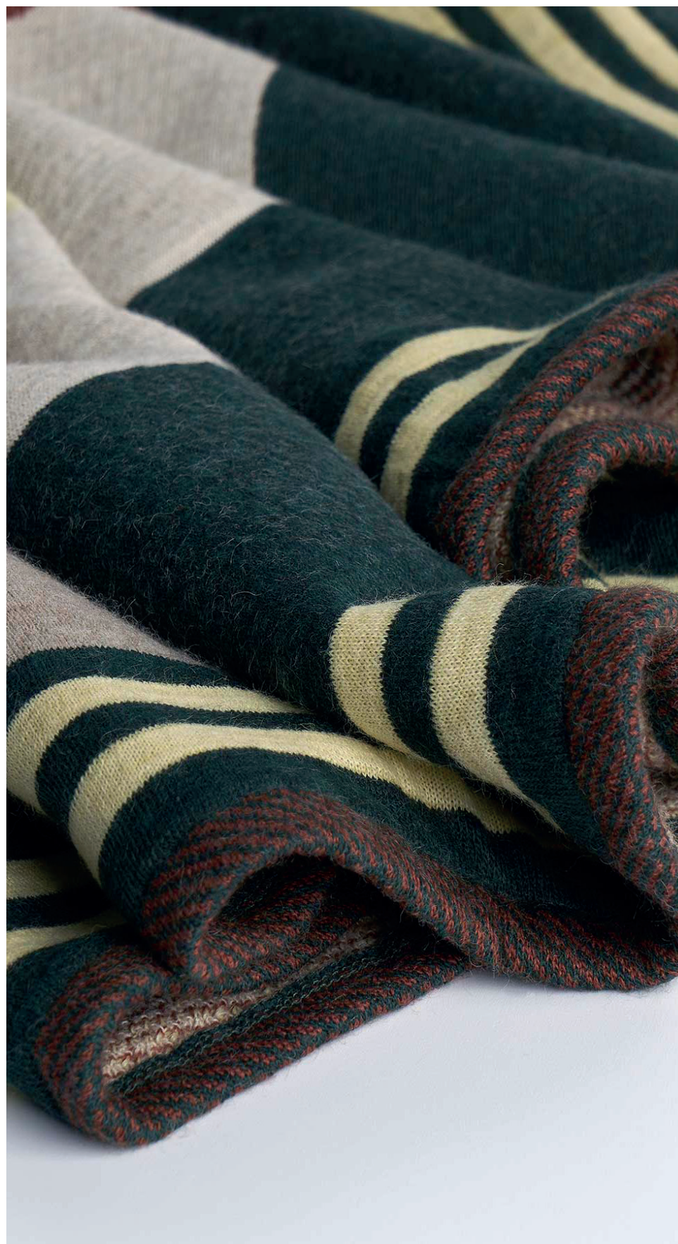
Variante 407 Verde pino