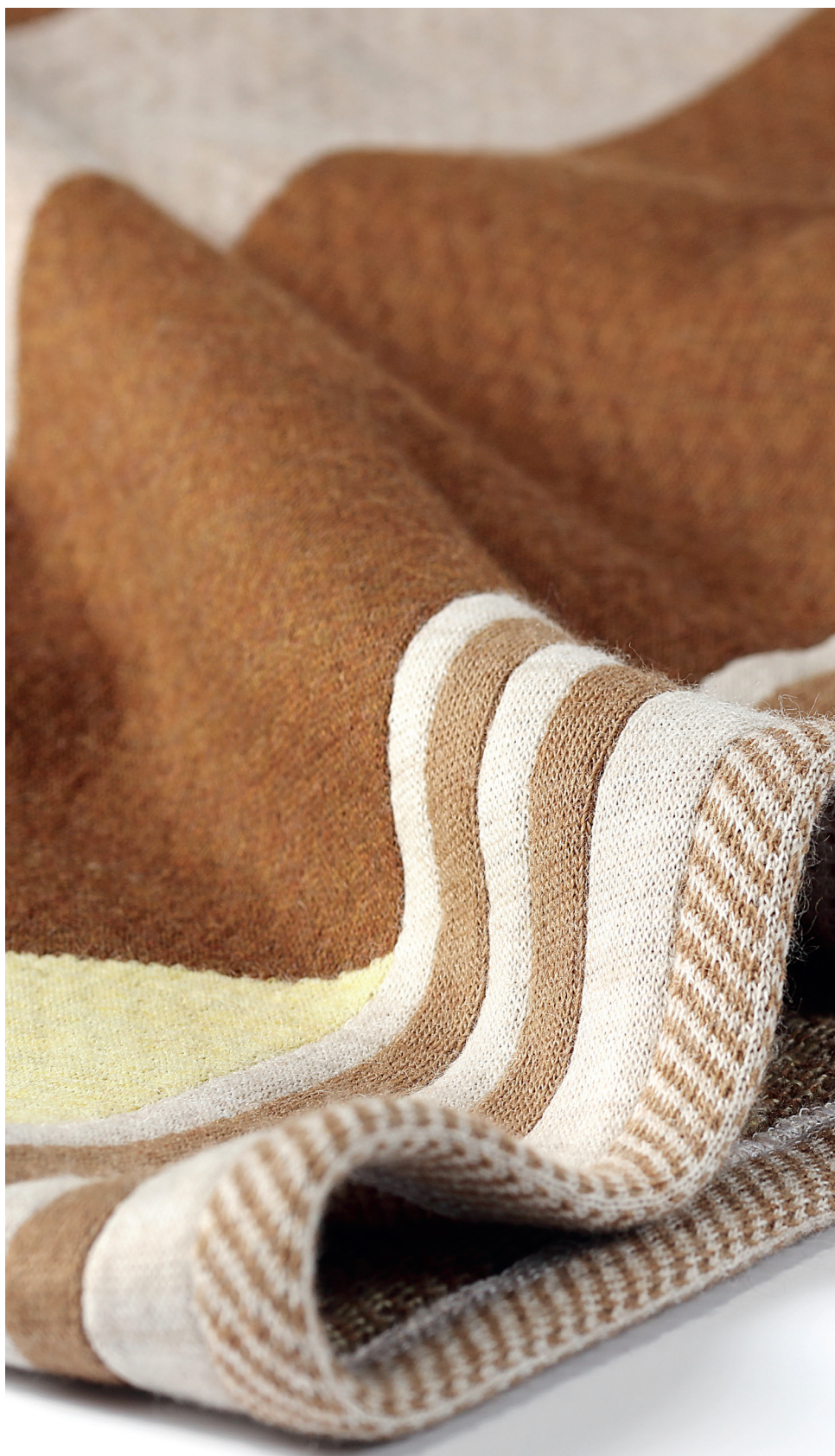
Variante 216 Tabacco